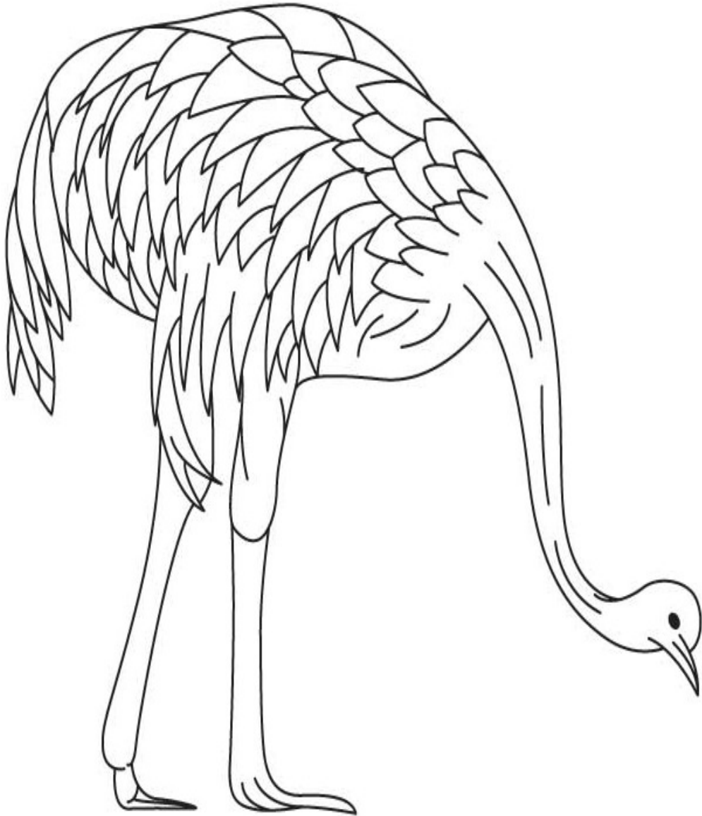
Image from: '50+ Australian Animal Template Shapes, Crafts & Colouring Pages' < https://www.template.net/design-templates/animal-templates/australian-animal-template/ >

Enlarge this image to A3 on a photocopier and then encourage students to use a range of detailed materials, colour and texture to make a collage and achieve an adorable yet vibrant effect, like the artwork in A-Z of Australian Animals .